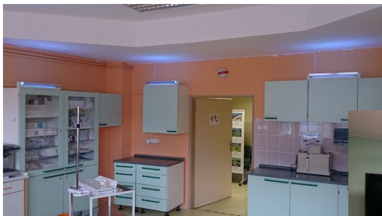
Motol Hospital - hematology

FOOD PRODUCTION - reduction of bacteria, fungi, yeasts, molds and other microorganisms.