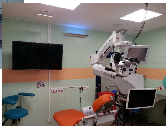
Eye Clinic Gemini - surgery. hall