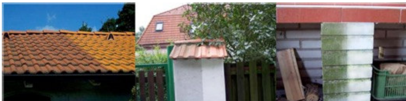
Viditelná účinnost po aplikaci FN® NANO ochrany (vpravo), po 5 letech od aplikace.