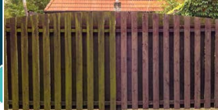
Contrast of untreated area (left) covered with green algae and FN® Wood (right)