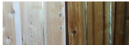
Contrast FN® Wood treated areas (left) and untreated areas dark due to UV (right)